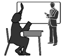
A good teacher

D o you remember the teachers you had at school? Some were good – and you learnt a lot from them. Jesus was a very good teacher. 1 He often used parables in His teaching. Parables are interesting stories with a hidden meaning.