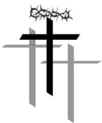
He would suffer on the cross!