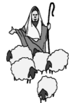
An eastern shepherd