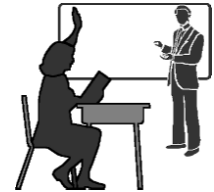
A good teacher

Three of Jesus' parables compared sinful people, like us, to things that are lost and joyfully found. 2 The lesson of all three parables is plain. There is rejoicing in Heaven when lost sinners come "home" to God.