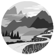
Laws of happiness

Now look at other aspects of His teaching.