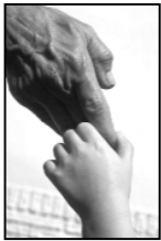
The loving hand

The perfection of Jesus showed up the imperfection of others. Even Peter (His disciple) felt an overpowering sense of his own sinfulness in the presence of Jesus. 4 Jesus “knew no sin”. 5 Consider the evidence for this in the record of His life that follows.