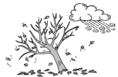
Temptation is like a forceful wind

T hink of a wind so powerful that it is difficult to remain upright. This is a picture of temptation. Temptation is like a forceful wind. Jesus knew the power of temptation, and the misery into which sin could drag a person. Though Jesus Himself had never sinned, He had compassion on those who had.