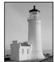
Jesus was a great light

God never made people hate Jesus, but He used the hate that was in man to bring about His purposes. The perfect life of Jesus made the imperfections of others more obvious. So they hated Jesus, and preferred to kill Him rather than have their own sinful ways exposed by His light. Jesus was a light in a dark world. Men tried to extinguish the light, preferring the darkness of their sin. Look up John 3:19