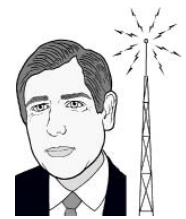
Hearing and responding

Jesus said, “What do you think about the Christ?” 1 In this course we have been finding out about Christ. What do you think about Him, and how are you going to respond? Jesus wanted people to respond by acting on the things He said. He told them to use their ears and not be indifferent, as if deaf.