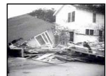
The story of two houses!

Jesus told a parable about two houses to explain the folly of not acting on His words. One of these houses was built on earth, and the other on rock. When storms and floods threatened the stability of both houses the one on