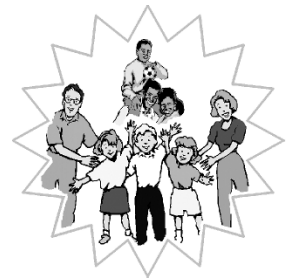
God's own family

S o how did those early believers in Christ respond to the Gospel? They responded by being baptised and joining the church. About 3,000 "were added" in one day! It was only natural that they should join, as they now belonged to the same family – the family of God. They were soon to gain strength from the warm friendship of other believers.